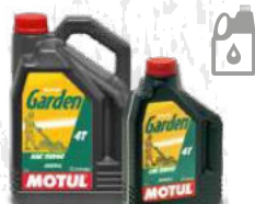
MT101311 MOTUL OIL 2 LITERS MT-101312 MOTUL OIL 2 LITERS