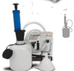
HY-OILEX16 OIL EXTRACTOR KIT 1,6 L