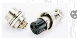
AC-ATS12-3PINS-3000 ATS CONNECTOR