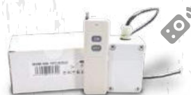
AC-RC300-3000 REMOTE CONTROL 300M