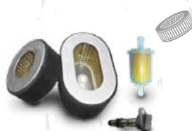
SP-KITMAN-D400 OIL FILTER / FUEL FILTER / AIR FILTER